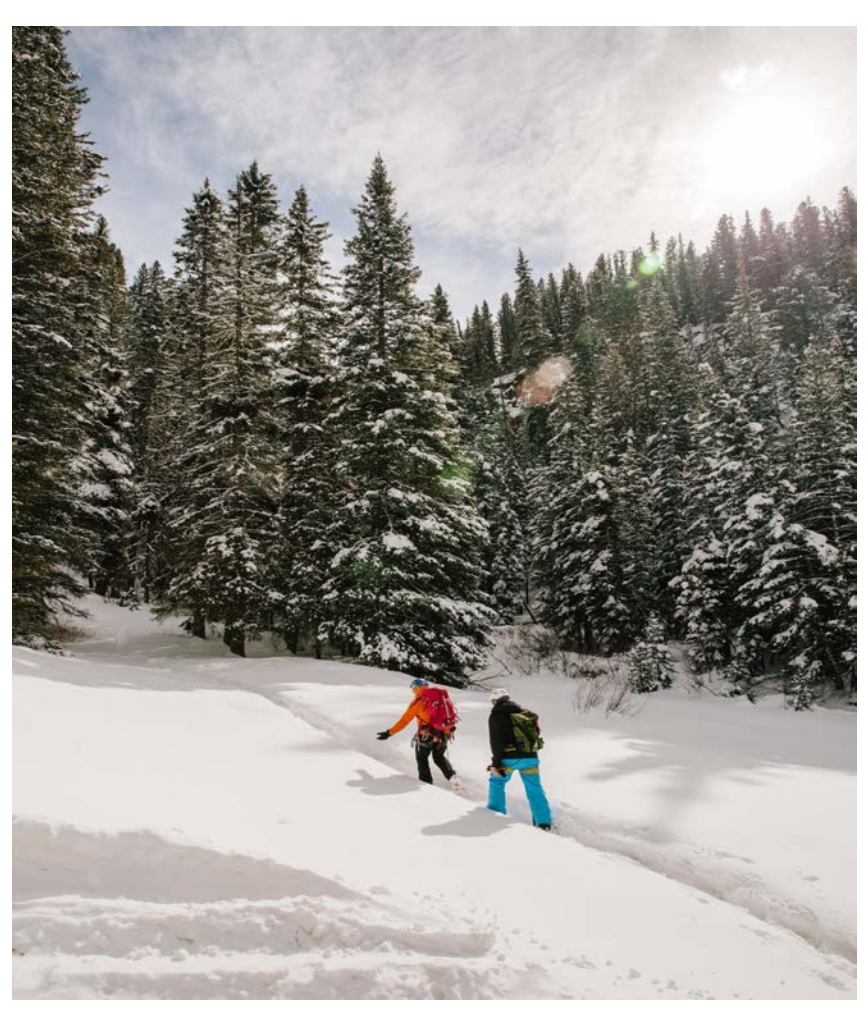
Cancellation Policy Cancellations within 72 hours of the scheduled activity will result in full payment For your convenience, a customary 20% service charge will be added to your activity invoice.

Age Restrictions: You must be at least 6 years of age.