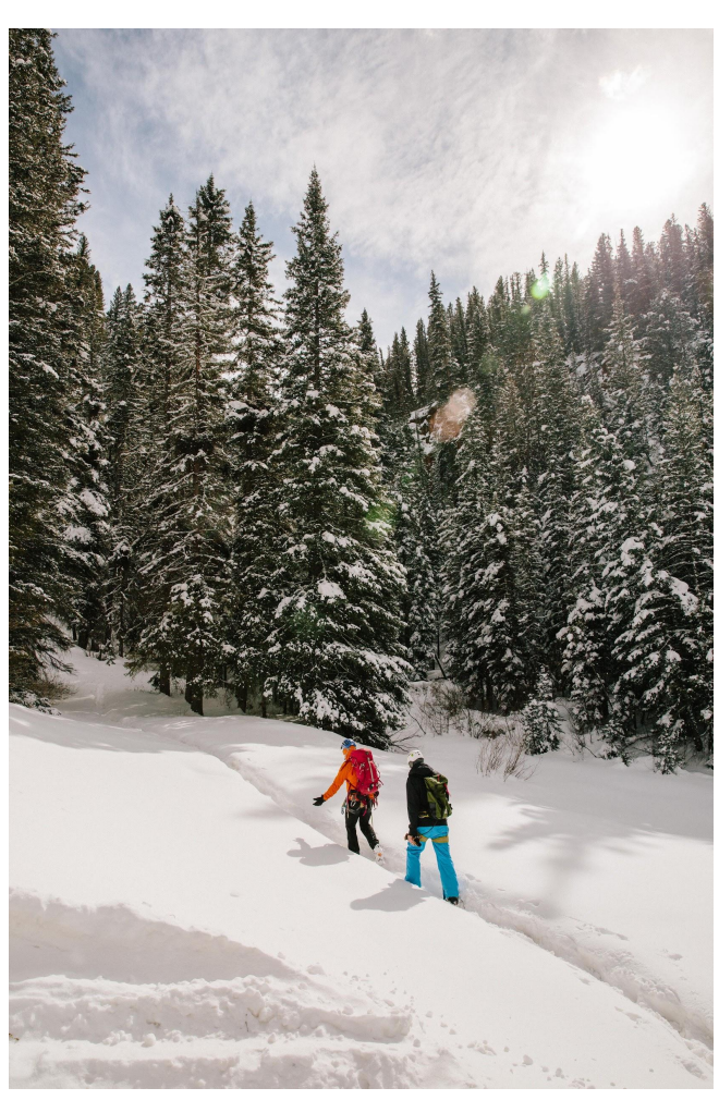
Cancellation Policy Cancellations within 72 hours of the scheduled activity will result in full payment For your convenience, a customary 20% service charge will be added to your activity invoice.

Age Restrictions: You must be at least 6 years of age.